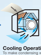
Cooling Operation To make condensing water.