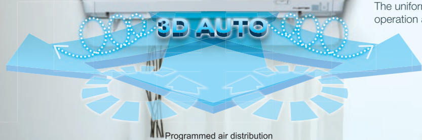
Programmed air distribution

3D AUTO is a one touch program where multi motors make three independent air flow controls. The uniform and quiet airflow can be delivered to every corner of the room, achieving economical operation and minimizing energy loss.