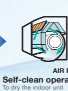
Self-clean operation To dry the indoor unit